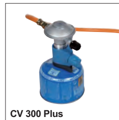
CV 300 Plus