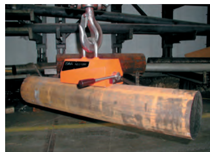
Solid cylindrical material