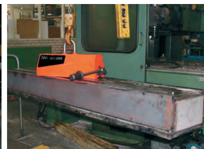
Heavy construction part

Ordering example: Permanent lifting magnet SAV 531.01 - 150 Designation SAV - No. - Model