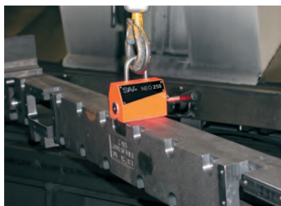
Cast part in a machining centre