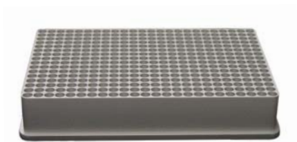
3200204: 384 Pos. PCR Plate