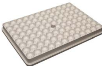
3200279: Round Bottom Plate