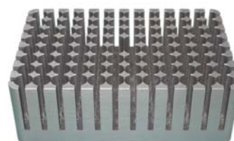
3200239: Round Well Adapter 96