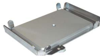
7900016: Flat Bottom Plate