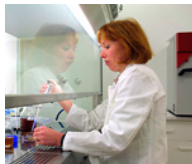
Basic Research / Research Institutes