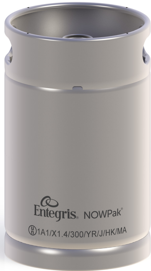
NO-08A-63, 19-liter reusable canister safely transports high-purity materials