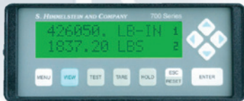
To power and display Torque only, use a Model 703+. To power and display Torque, Speed and HP, use a Model 723+. See Bulletins 372 & 374.

*NIST traceable calibration performed in our accredited laboratory (NVLAP Lab Code 200487-0). For details visit www.himmelstein.com or follow the accreditation link at www.nist.gov .