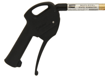
Pistol grip style handle Model ST1