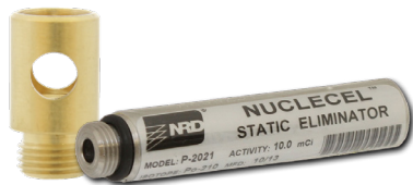
Replacement cartridge and tip Model P-2021-8001