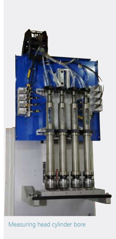
Measuring head cylinder bore