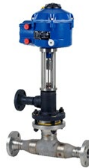
I-Series with Electric Actuator