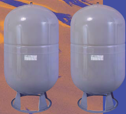
XT-XTV Series - Expansion Tanks