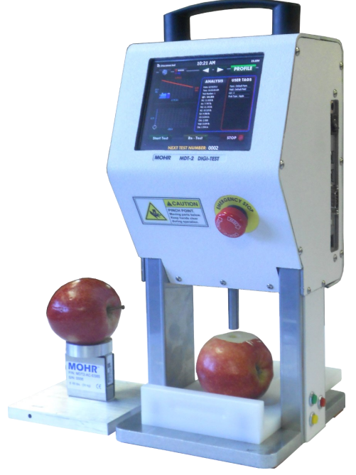
MDT-2 Penetrometer and Texture Analyzer