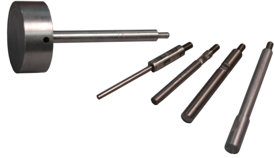
Variety of interchangeable probe types