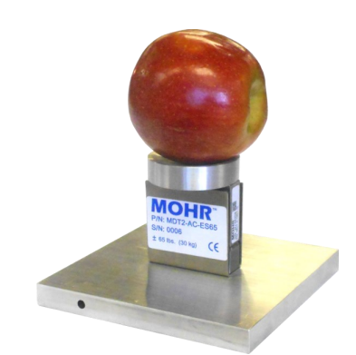
Standard external precision scale