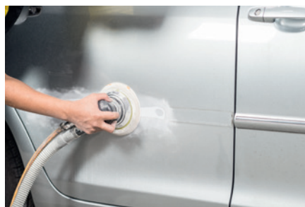
Automotive crash repair