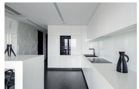
High gloss kitchen furniture