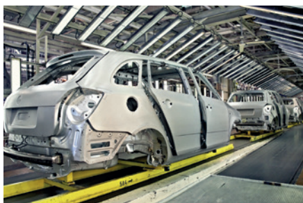
Automotive industry | E-coat