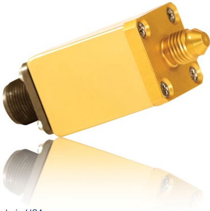
Made in USA