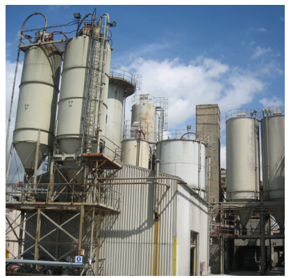
An example of silo level measurement.