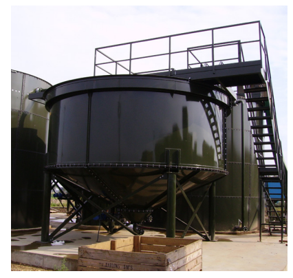
Liquid Tank Level Monitoring