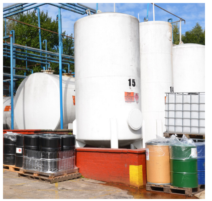
An example of tank level measurement.