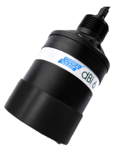
dBi6 Profibus PA Transducer with Submergence Shield.

dBi Profibus PA Transducers are highly developed ultrasonic level measurement devices that provide non-contacting level measurement for a wide variety of applications in both liquids and solids. Their unique design gives an unrivaled performance in echo discrimination and accuracy in a Profibus PA device.