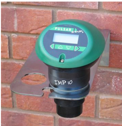
Optional mounting bracket for IMP sensors