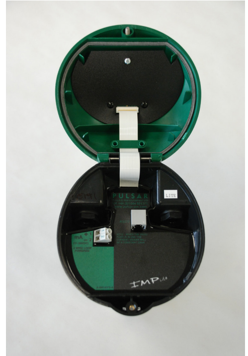
Inside the lid of an IMP Lite