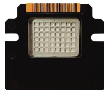
Stainless steel microchip with 48 microreactors.