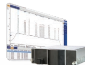
Optical spectrum analyzers FTBx-5245 / FTBx-5255 / FTBx-5243-HWA