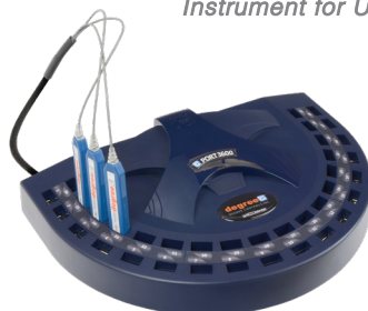
°C Port3600 Data Acquisition Instrument for USB Sensors

603.672.8900 or 1.877.334.7332 sales@degreeC.com www.degreeC.com