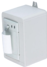
T24-PR1 Wireless surface mounting tally roll printer