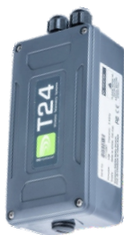
T24-SO Wireless serial ASCII output module