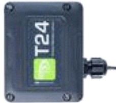
T24-BSue Wireless USB extended range base station