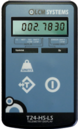
T24-HS-LS Simple wireless display for connecting to 1 load cell