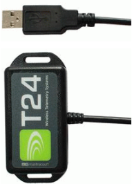
T24-BSu Wireless USB connected base station