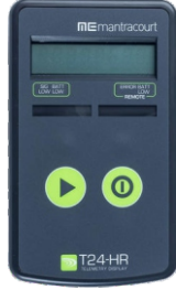
T24-HR Wireless display for connecting to multiple load cells