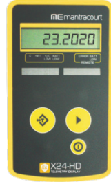
X24-HD ATEX Wireless display for connection to up to 24 load cells