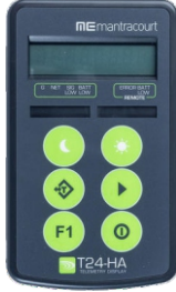
T24-HA Wireless display for connection to up to 12 load cells