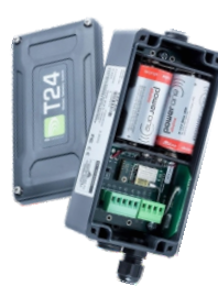
T24-AR Wireless range extender repeater module