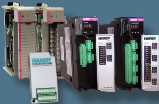
Allen-Bradley® Compatible Plug-in Weigh Scale Modules

Controllers, Weigh Modules, Weight Processors