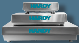
Hardy Bench Scales