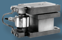
ADVANTAGE Series Load Point with C2 Calibration

Hardy carries a wide variety of strain gauge load points and scales to meet your application requirements.