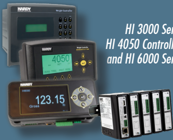
HI 3000 Series HI 4050 Controllers and HI 6000 Series