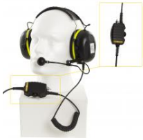
VMP-36-PEL-A Item Number: 1020600767