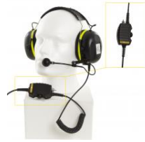
VMP-36-PELP-A Item Number: 1020600768