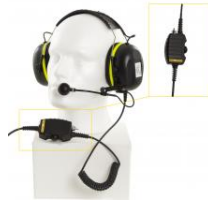
VMP-36-PEL-A/15 Item Number: 1020600769