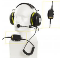
VMP-36-PEL-A/20 Item Number: 1020600770