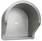
MODEL-A Item Number: 3005000029