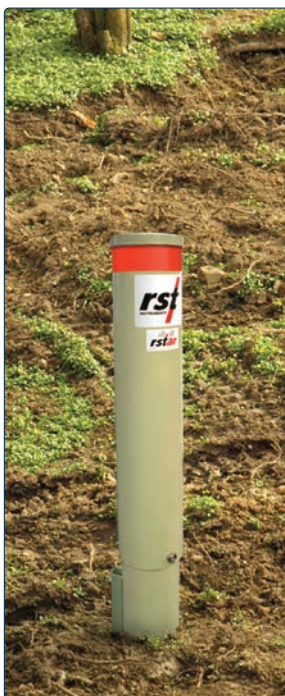
The GAA2820 Slope Monitoring System is housed in an 8 in. Secondary Enclosure which can be ordered separately. The enclosure uses an 11 mm nut driver to secure the removable cover.