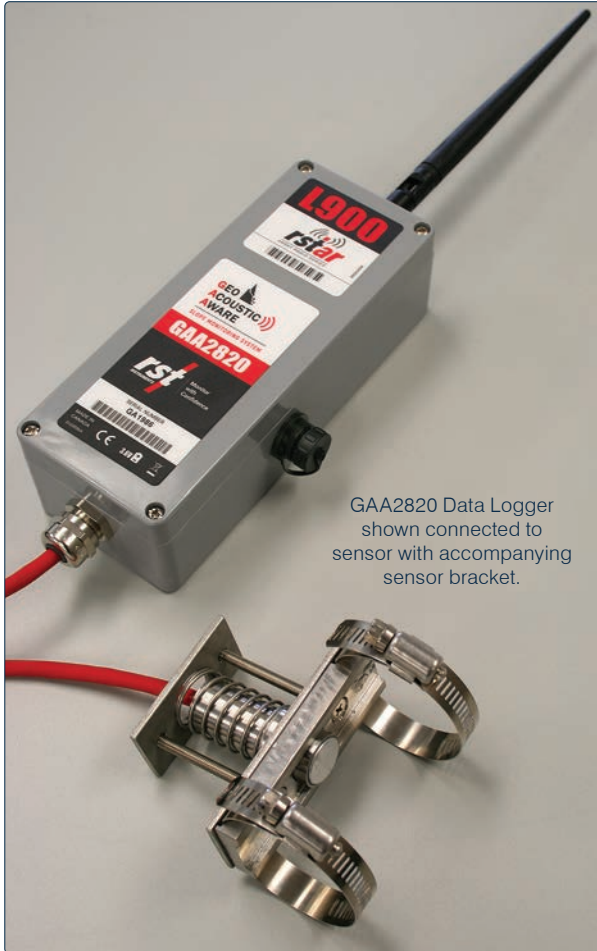
GAA2820 Data Logger shown connected to sensor with accompanying sensor bracket.