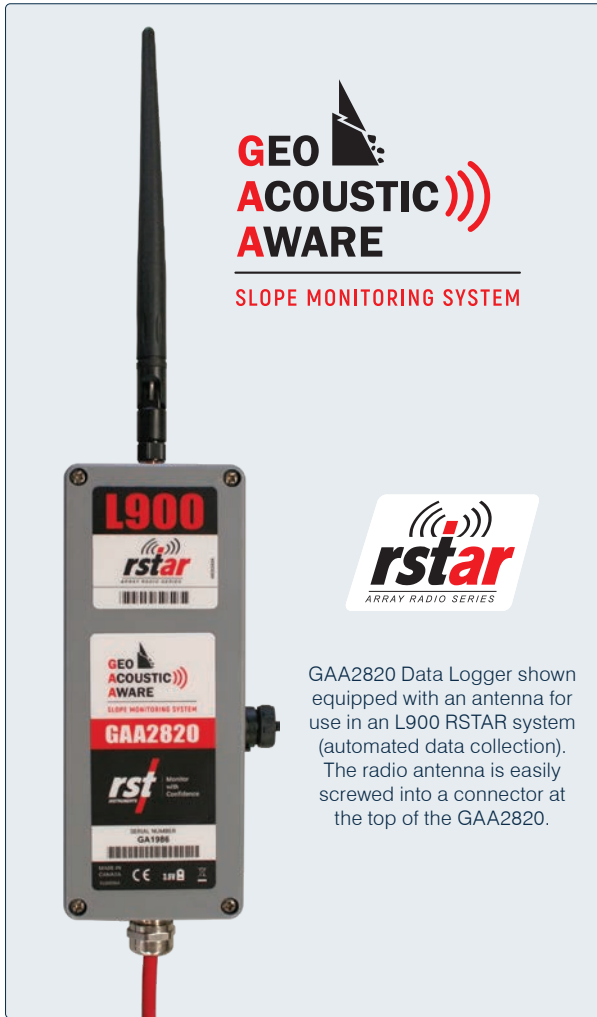
GAA2820 Data Logger shown equipped with an antenna for use in an L900 RSTAR system (automated data collection). The radio antenna is easily screwed into a connector at the top of the GAA2820.