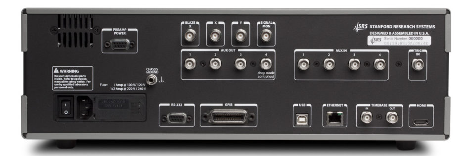
SR865A rear panel