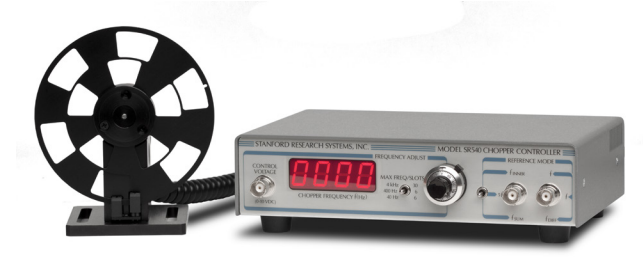
SR540 Optical Chopper

Synchronous filtering may also be selected at reference frequencies below 4 kHz. The synchronous filter notches out multiples of the reference frequency and is extremely useful in making low frequency measurement where multiples of the reference frequency would otherwise show up in the lock-in output. Unlike previous designs the synchronous filter in the SR865A can be selected with no loss of output resolution.