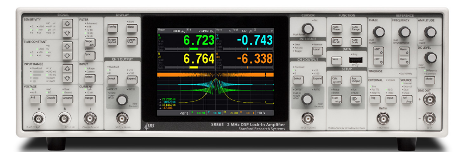
SR865A front panel