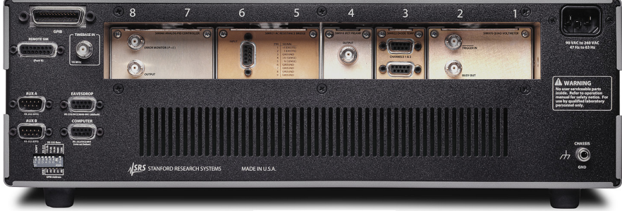
SIM900 rear panel