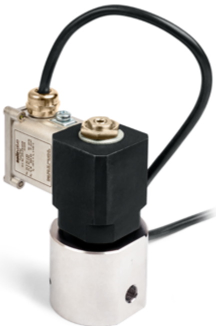
HyValve 1000, Type 3105