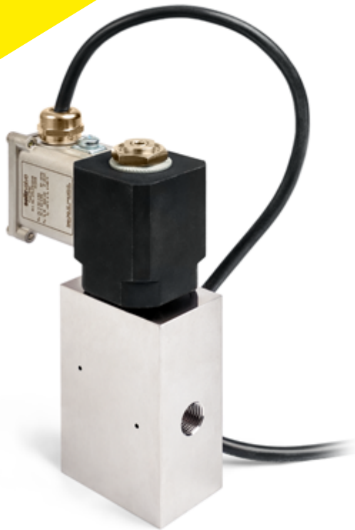
HyValve 1000, Type 3106

Combined with optimal flow rate and fast filling, our HyValve range will convince you by its high availability due to the broad temperature range, high repeatability, utmost safety and exceptional reliability.