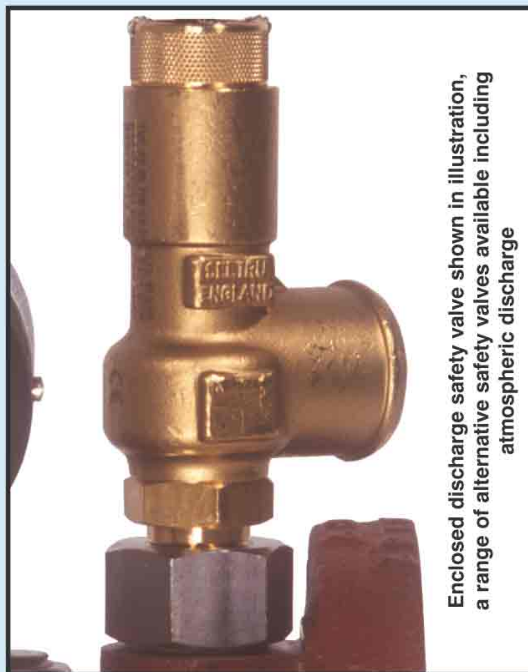
Enclosed discharge safety valve shown in illustration, a range of alternative safety valves available including atmospheric discharge

A connection is provided for connection of an inspectors pressure test gauge.