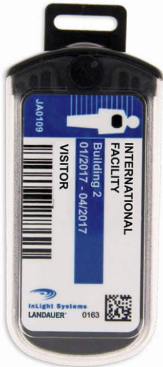
LANDAUER Holder Design