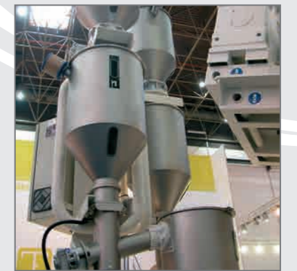
COMPO AF: FOR STARVE FEEDING EXTRUDERS