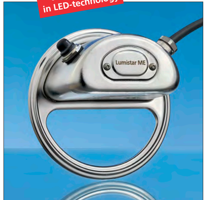
Lumiglas luminaire Lumistar ME in stainless steel