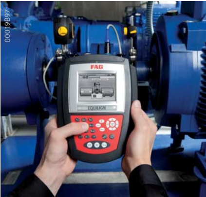
The FAG Top-Laser EQUILIGN is easy to handle