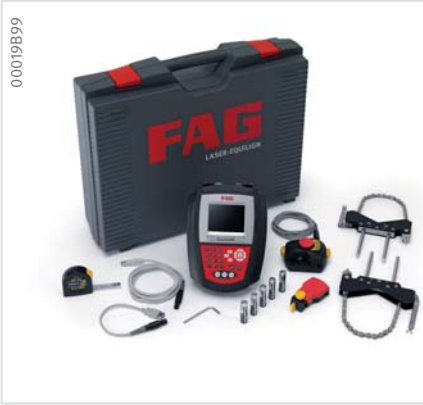
Delivery scope of the FAG Top-Laser EQUILIGN