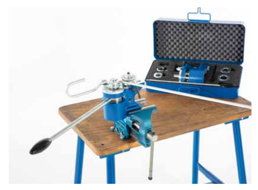
Quick and handy in the bench vice