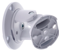
Adjustment Bracket 3000-201