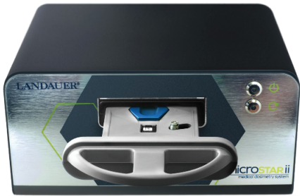
nanoDots are read directly in the microSTARii reader

This is a nanoDot with alphanumeric sensitivity code and serial number (DN091=0.91 sensitivity). Either the front or back of the carrier can face toward the radiation source during exposure